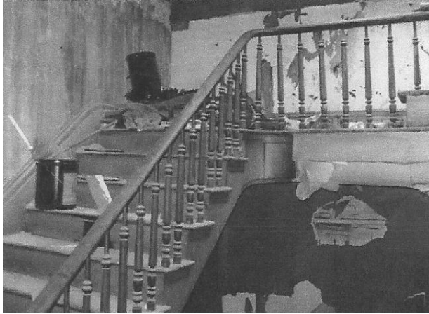
Winding staircase to 3rd floor through 2nd floor north side apartment

The Randolph House Hotel truly was the hub of Macomb, with its guests and citizens socializing and conducting business during the early part of our city's history. While the building still stands today, the structure continues to deteriorate and the potential loss of