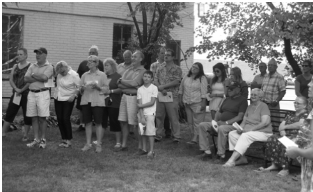
Thank you again for helping make the Bailey House what it is today.