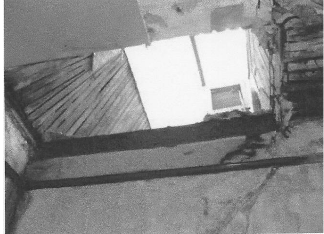
Former Randolph Hotel (Sky Light) on 3rd floor

this structure grows each and every day. Left as is the elements of time will continue its gradual deterioration.