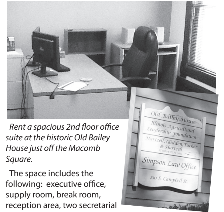
Rent a spacious 2nd floor office suite at the historic Old Bailey House just off the Macomb Square.

The space includes the following: executive office, supply room, break room, reception area, two secretarial offices and a spacious bathroom.